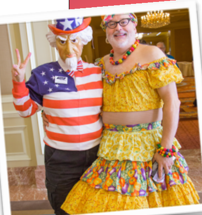
(Above) Two understated Squeeze the Hive attendees.

ALERT: Registration Rate increases from $240 to $265 on April 1st, so sign up quickly!